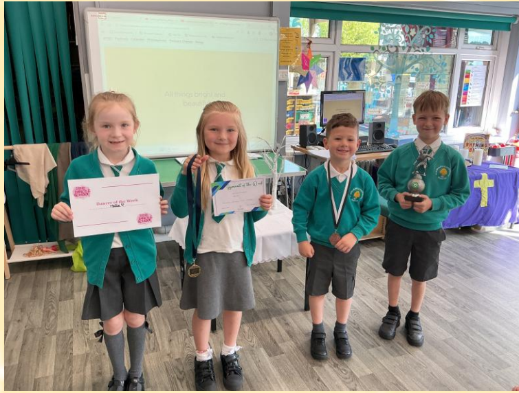
Dancing Gymnastics Football Football

If your child has recently received an award they would like to share with us, eg swimming, football, dance, Beavers, Brownies etc please send them into school & we will share them during our Celebration Worship on Friday.