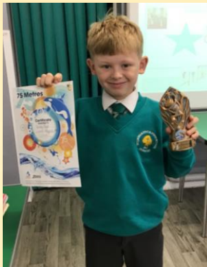
Fishing & Swimming