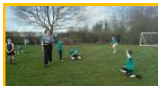
Foxes playing rounders