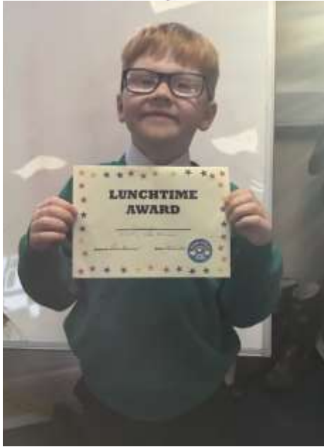
Well done - special recognition from the lunchtime staff!