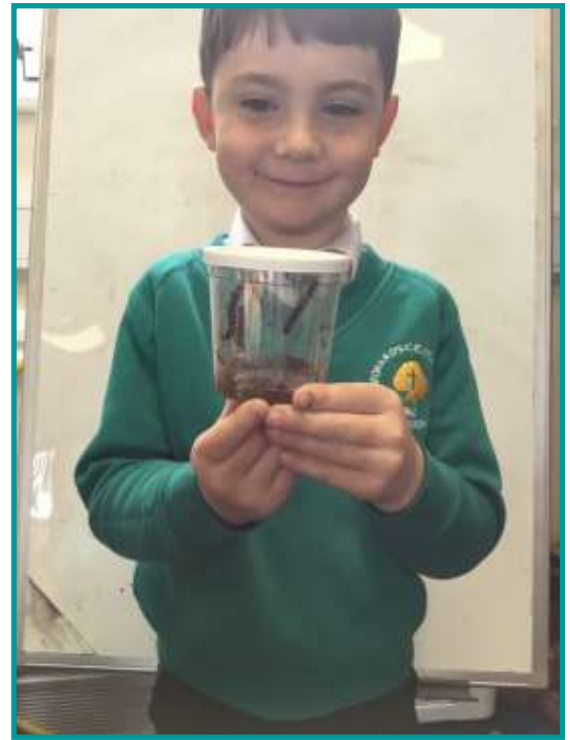
Owls are pleased to see their caterpillars thriving they are growing everyday!

©Bible Story Maps www.biblestorymaps.com