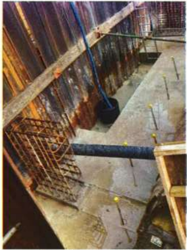
Figure 6: West Pile Cap (01/05/2024)