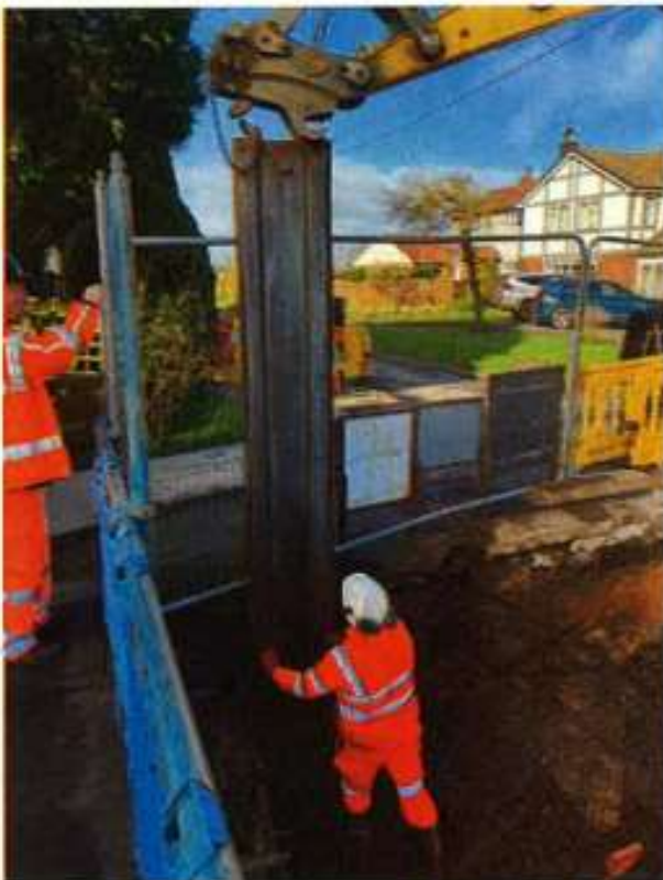
Figure 3: West Temporary Works (18/03/2024)