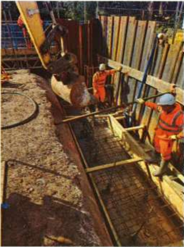
Figure 5: West Pile Cap Concrete Pour (26/04/2024)