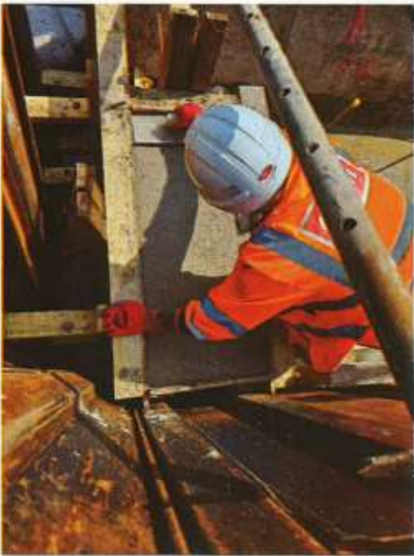
Figure 7: West Wing Wall Stem Concrete Pour (08/05/2024)