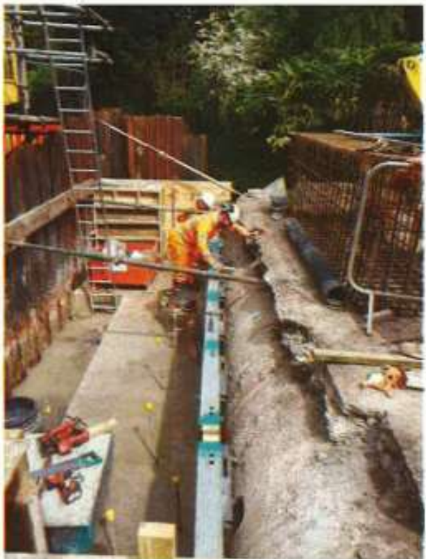
Figure 8: West Abutment Shuttering (10/05/2024)