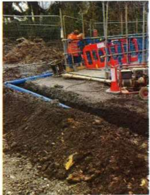
Figure 2: Water Main Diversion (26/02/2024)