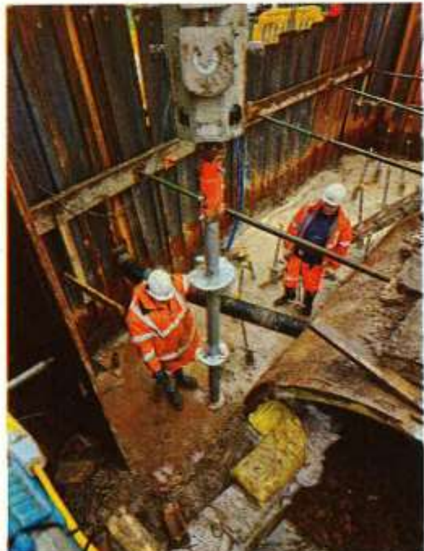
Figure 4: West Screw Pile Installation (02/04/2024)