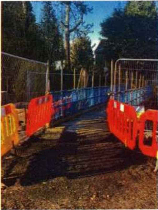
Figure 1: Temporary Pedestrian Bridge (19/02/2024)