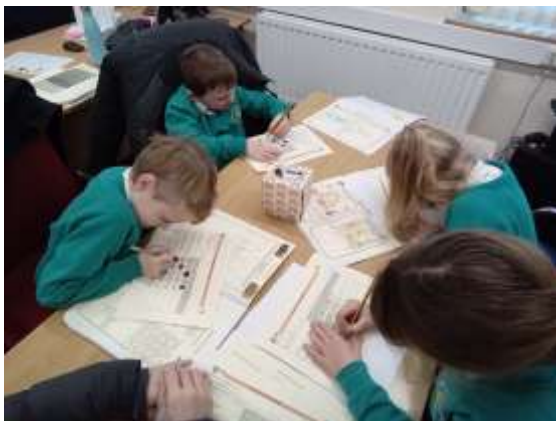
Children discussed their RE learning in school to see if/how we can improve their learning.