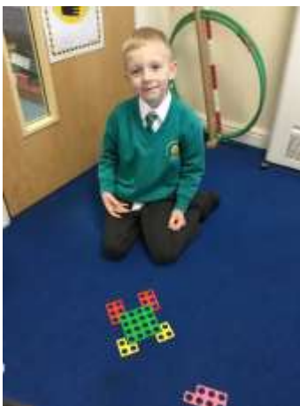
Owls have been making symmetrical patterns using Numicon