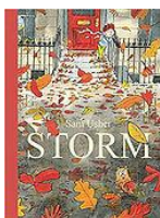
Storm – Sam Usher