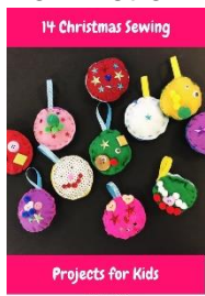
14 Christmas Sewing Projects for Kids (Link to instruction writing)